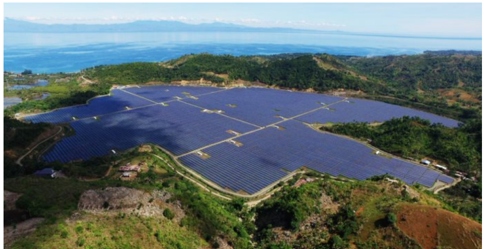
Actual site photos